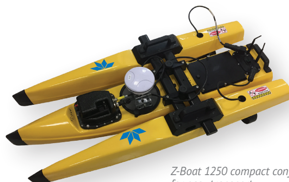
Z-Boat 1250 compact configuration for easy transport